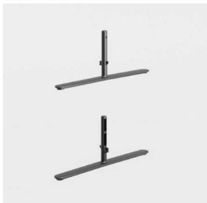
Leg set single screen w40xh50xd400 mm

Aluminium leg in black/grey/white lacquer. Adjustable feet can be purchased separately.