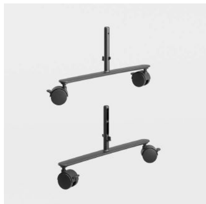
Leg set with lockable wheels