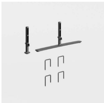
Leg set, expander pack