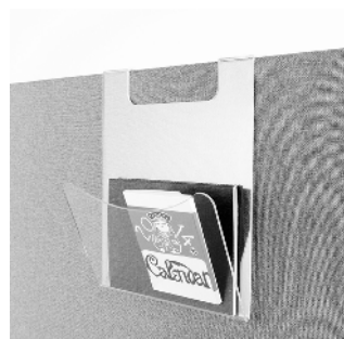
Plexi shelf Post box