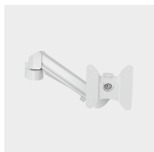
Monitor arm LC55