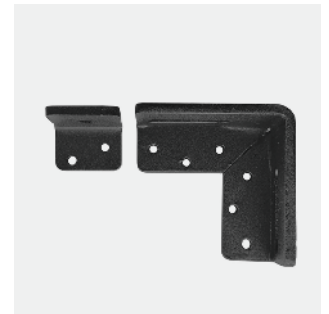
(2 x) Hidden fittings Black, white or grey