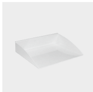
System shelf C4