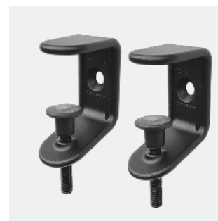
Clamp fittings Black, white or grey