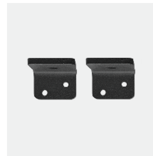
Hidden fittings Black, white or grey