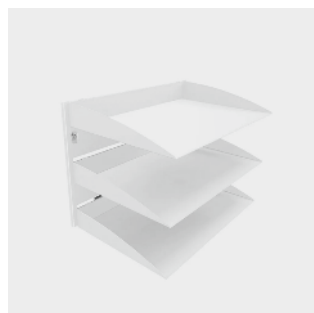
Sorting compartment 3xC4