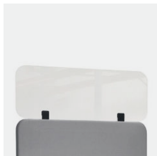
Plexi upper section 800/1000/1200/1400/1600/1800/2000 x285 mm