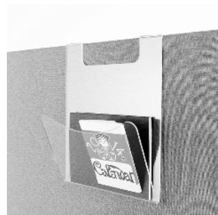
Plexi letter holder