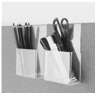
Plexi pen holder