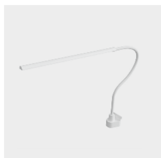
Flexible LED lamp