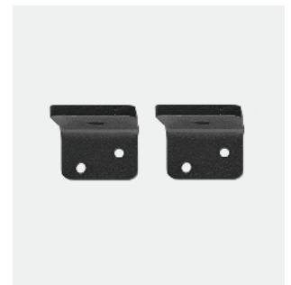
Hidden fittings Black, white or grey